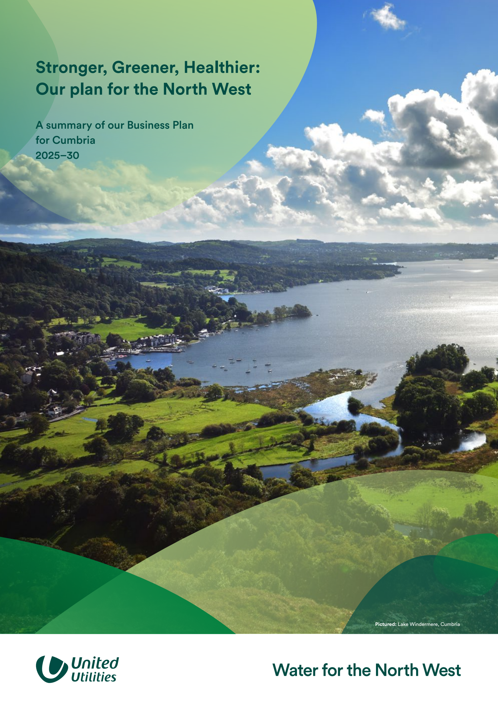
Pictured: Lake Windermere, Cumbria

A summary of our Business Plan for Cumbria 2025–30